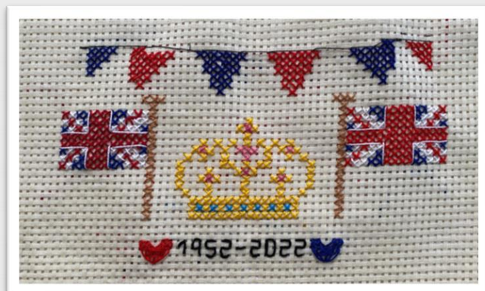
Cross stitch by Hayssa (6T)

Children need to be at school, in costume, at 2.40pm as the pageant starts at 3.00pm.