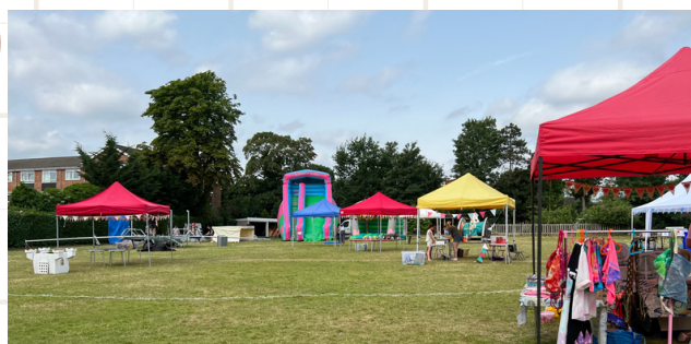
Summer Fete & Christmas Fayre